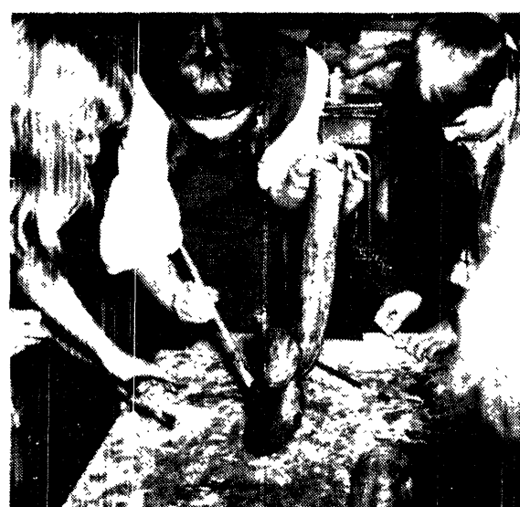
The finishing touches, clear wood sealer, are applied to the student's projects.