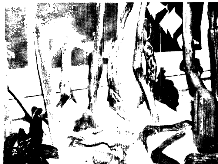
Shown here is the finished product.