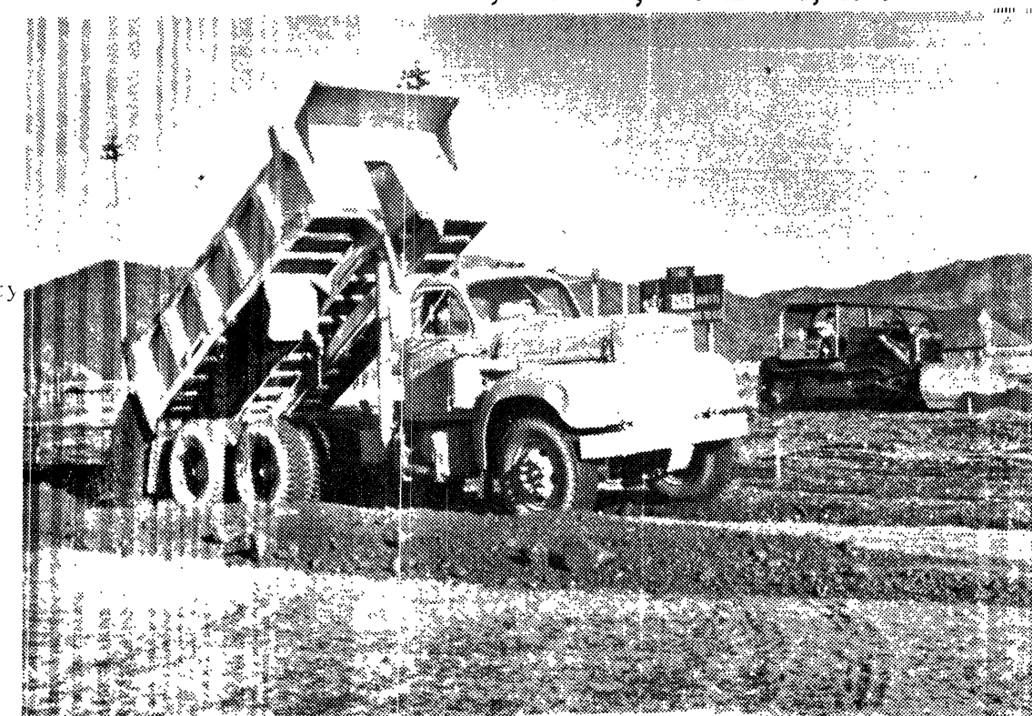
THE CROWNING OF SPARTAN FIELD-Spartan football field was under heavy construction over the weekend. Volunteers are working to place a crown on the weather beaten gridiron.

"One deer sure would make up for all this though. So we'll keep trying."